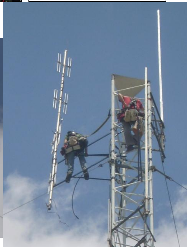
Recent tower work on Waterworks Hill. (The outside stuff) These fellows are up in the air at 160'. They worked from morning to dark moving antennas and re-routing coax. It was like getting a remodel. This should last for quite a while. Hope I'm around to see the next remodel.