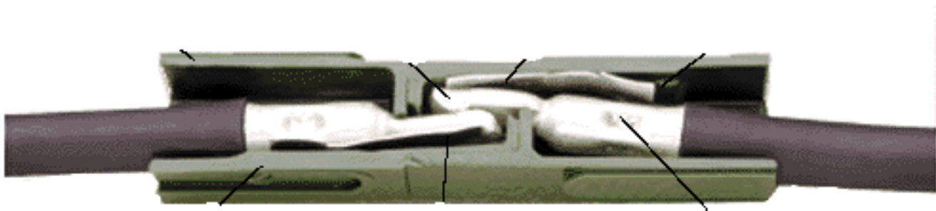
Diagram used with permission of Anderson Interconnect Inc., manufacturer of the Anderson Powerpole connectors.